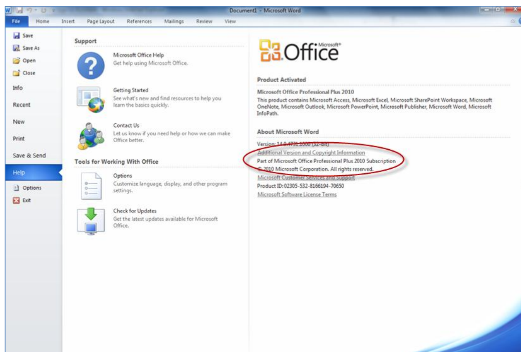
Figure 3: "Part of Microsoft Office Professional Plus 2010 Subscription"

To determine if their versions of Office are subscription versions, users can open any of the installed Office Professional Plus applications and then view the Help screen. To view the help screen, click File , and then click Help . On the Help screen, below the Version information and Additional Version and Copyright Information hyperlink, subscription versions of Office Professional Plus will display the following message: “Part of Microsoft Office Professional Plus 2010 Subscription” Non-subscription versions of Office will not contain the word “subscription.” See Figure 3 for an example of this message.